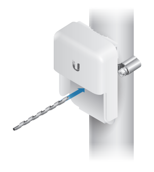
2. Drill a pilot hole into the pole.